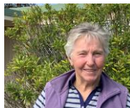
Rose Schick Catering, Registration

Deposits will not be refunded if cancellation is after the 15/9/2024 and full payment not refunded after the 15/10/2024